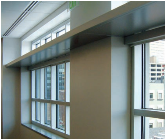
INLIGHTEN® LIGHT SHELF