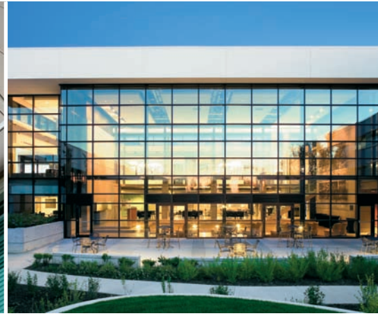
HIGH-PERFORMANCE THERMAL PRODUCTS

Designed to shade interiors and optimize energy performance by reducing solar heat gain, 1600 SunShade® works with Kawneer products to allow greater use of glazing while reducing demand on the HVAC. These properties can help qualify for LEED points in the Energy & Atmosphere category.