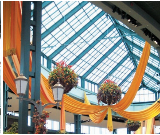
1600 SLOPED GLAZING & 2000 SKYLIGHT