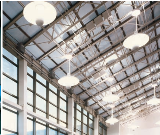
1600 POWERWALL® 1600 POWERSLOPE®