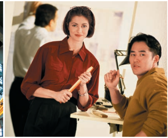
ARCHITECTURAL SERVICES TEAM (AST)

InLighten® Light Shelf is designed to integrate with 1600 curtain wall systems to reflect natural light deeper into occupied spaces. InLighten® directs available natural light to interior spaces and can help qualify for points in the Indoor Environmental Quality category. In addition, light shelves have been proven to reduce requirements for artificial perimeter lighting, thereby conserving electrical energy costs.