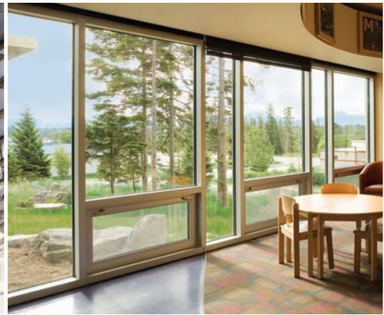
THERMALLY-BROKEN, ARCHITECTURAL GRADE OPERABLE WINDOWS AND 512 VENTROW ISOLOCK® VENTILATOR

Credits may be obtained for renewable energy in the Energy & Atmosphere category for LEED certification. Photovoltaic (PV) cells in the 1600 PowerShade® convert light energy from the sun into electricity, which can be fed into the building's system. On-site renewable energy reduces the environmental impact associated with the use of fossil fuels.